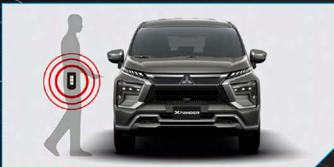
Keyless Operation System (for GLS)