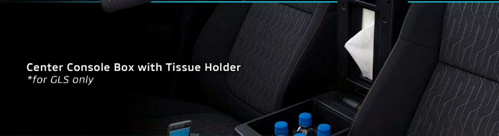
Center Console Box with Tissue Holder *for GLS only