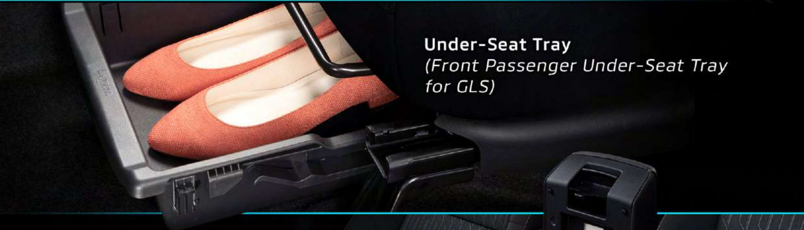
Under-Seat Tray (Front Passenger Under-Seat Tray for GLS)

Keep the cabin tidy and the crew powered. Smart storage spots and second-row charging make it easy to stash, grab, and go.