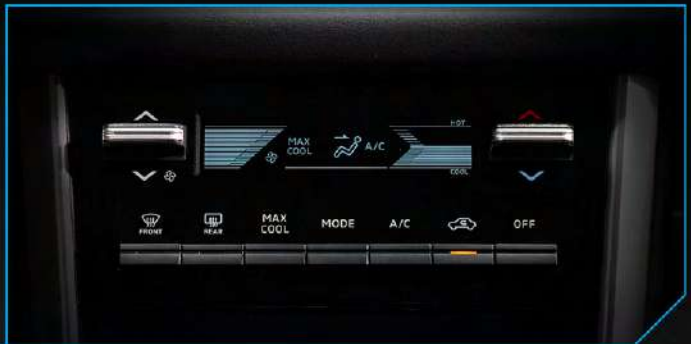
Digital Climate Control (for GLS)