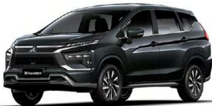
Graphite Gray Metallic Xpander GLS and GLX