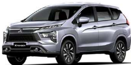
Blade Silver Metallic Xpander GLX