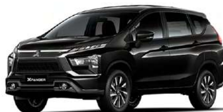
Jet Black Mica Xpander GLX