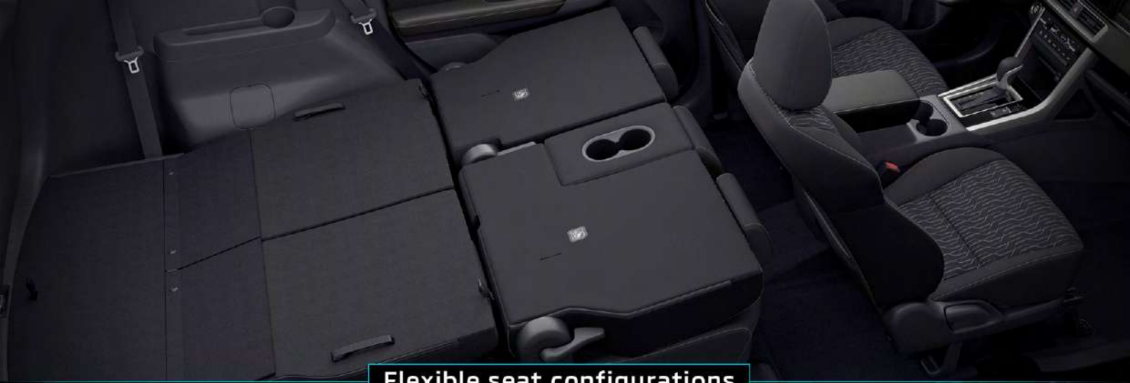
Flexible seat configurations