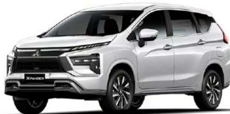
Quartz White Pearl Xpander GLS