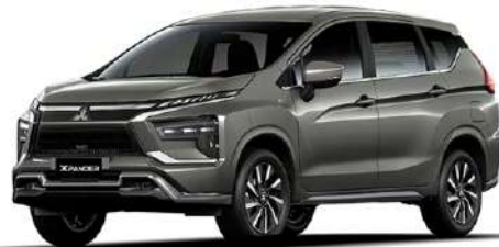
Green Bronze Metallic Xpander GLS