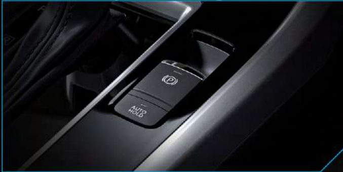
Electronic Parking Brake with Auto Hold (for GLS)

Stop-and-go becomes simple. Set the temperature, set the pace, and let the Xpander handle the smaller details so you can enjoy the ride.