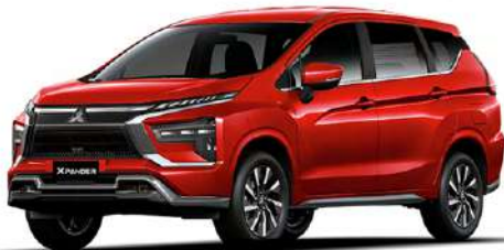
Red Metallic Xpander GLS