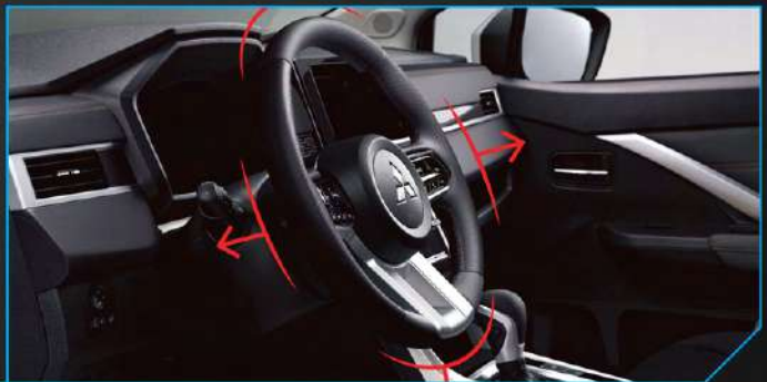
Tilt & Telescopic Adjusting Steering Wheel